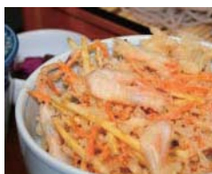
+300円 mini don