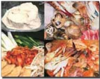
"Kaisen-Yuba KIMCHI Nabe"