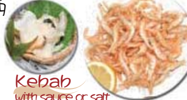
Kebab with sauce or salt